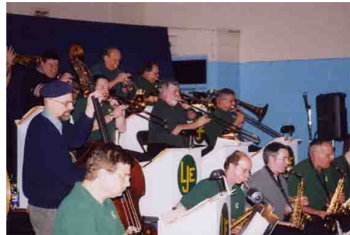
Loudoun Jazz Ensemble at Lovettsville

The purpose of the LJE is twofold: to provide a group in which area musicians who have a strong interest in "Big Band" jazz can rehearse on a regular basis; and to bring the results of their efforts to the people of Loudoun County and the surrounding areas. The LJE is committed to performing a wide variety of the